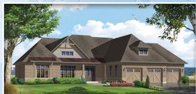
Bungalow Elev-A - 1860 sq.ft.