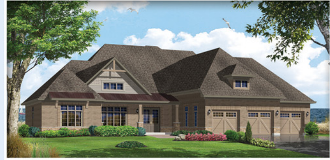
Bungalow Loft Elev-A - 2635 sq.ft.