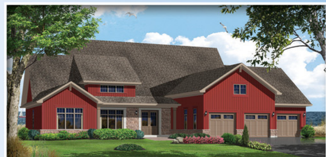
Bungalow Loft Elev-B - 2659 sq.ft.